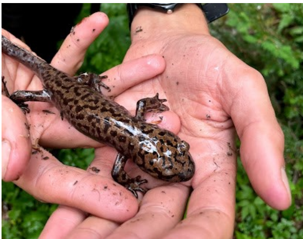
Encountered wild creatures