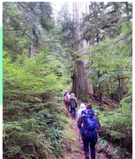
Explored Pacific Northwest ecosystems