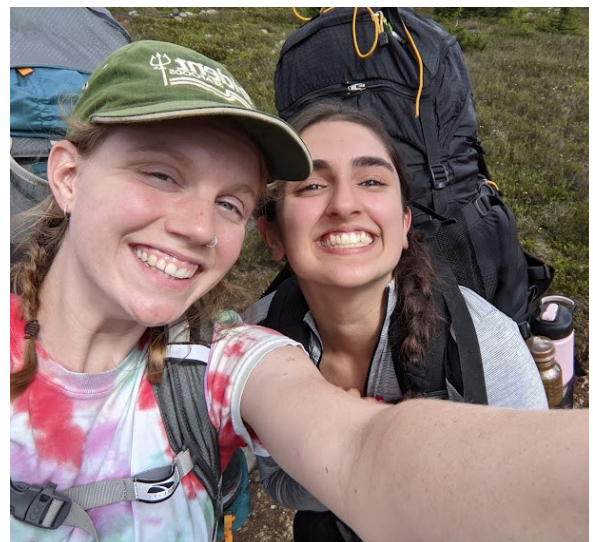
Made lasting friendships