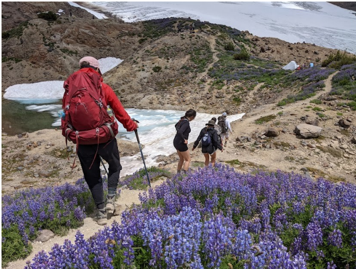
Experienced stunning landscapes