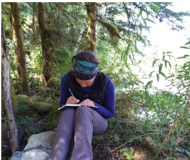
Reflected on their relationship with nature