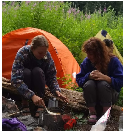
Learned backcountry skills